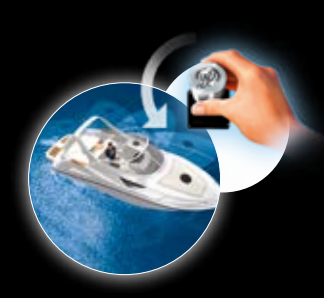
Simply twist the Axius joystick to turn to the boat around. Perfect for changing your direction in tight spaces.

With the Axius system you can control power and location with your fingertips. Need to go to the right? Push the joystick to the right. Hard and fast to the left? Push the joystick further to the left. With the Axius system the thrust is proportional to the amount of joystick movement – so the more you push the joystick in a particular direction, the more thrust is applied. All without the need of costly bow and stern thrusters. This proportional control makes docking easy and intuitive.